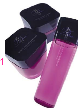
<Deesse's Neu due>